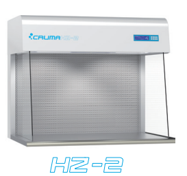
CRUMA BIOSAFETY CABINETS